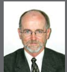
Peter McWalters, Commissioner of Education, Rhode Island

“The Rhode Island Department of Education recognizes NCATE accreditation as an indicator of quality educator preparation programs. Rhode Island institutions of higher education choose to participate in this rigorous self-study and accreditation process offered by NCATE concurrently with the Rhode Island Program Approval Process. The practice of a concurrent visit assures that Rhode Island graduates have met their respective institution’s guidelines for certification.”